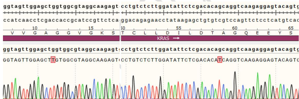
Figure 2 | The KRAS mutation analysis by Sanger sequencing.